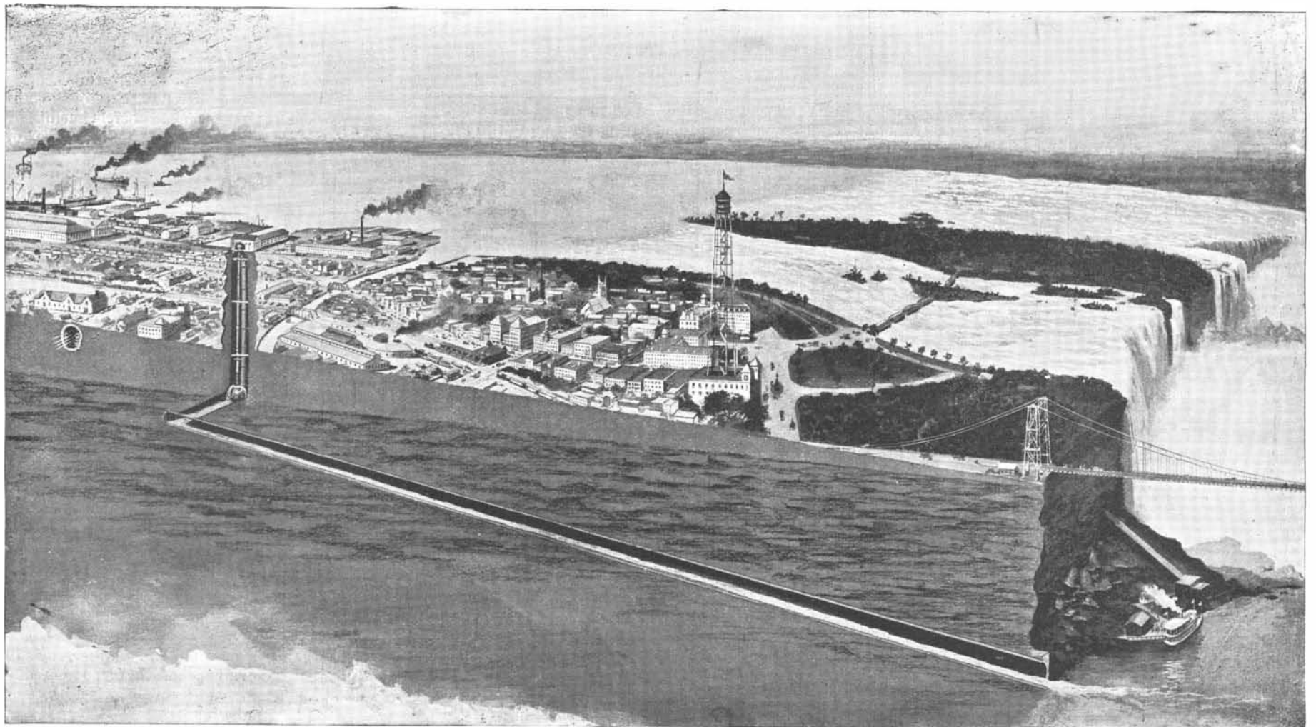
GREAT TUNNEL AND ONE OF THE WHEEL PITS AT NIAGARA FALLS.

In the SCIENTIFIC AMERICAN of March 5, 1892, we gave a full description, with numerous illustrations, of