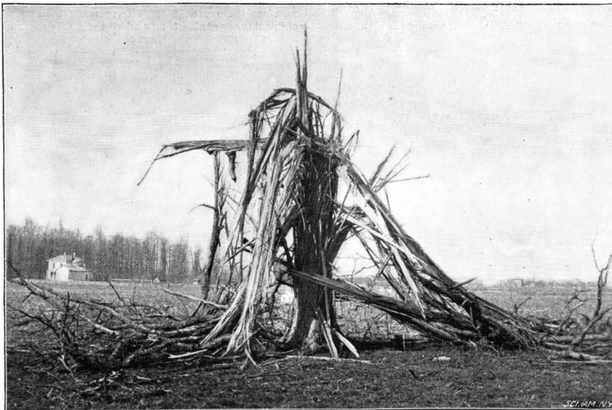
A TREE AT SIDNEY, OHIO. SHATTERED BY LIGHTNING

In such cases it is supposed the lightning converts the sap of the tree into steam with such tremendous energy as to cause the wood to explode in all directions. The process of the late A. S. Lyman, patented in 1858, for preparing wood for paper pulp, was based on the same principle. Lyman provided what he termed a steam gun, which consisted of a long steam boiler wherein blocks of wood were boiled under a very high pressure, and at the proper stage in the operation one end of the boiler was suddenly opened, when the contents shot out, and with a report like a cannon the fibers of the wood exploded, converting the wood into fine shreds.