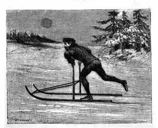
Fig. 2.-METHOD OF USING THE SPARKSTOTTING.

a type of sparkstotting in use in Norrland.