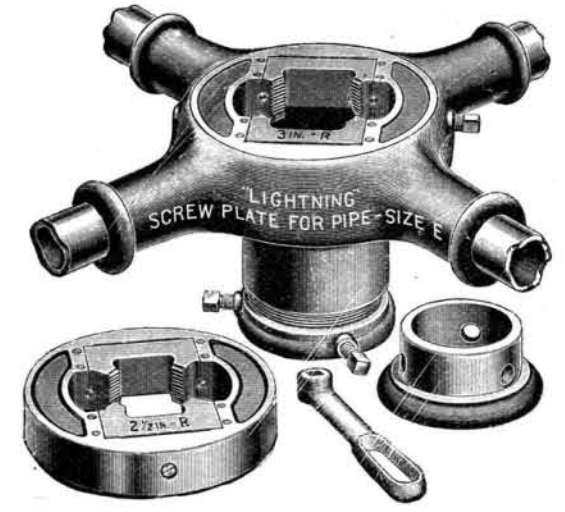
"LIGHTNING" SCREW PLATES FOR PIPE,

The particular superiority of this screw plate over others lies in its having its dies ready for use in their holders without the trouble and delay of changing and setting them. They are as simple in use as solid dies and at the same time they are readily ground when dull; are capable of being adjusted so as to take irregular sized fittings, etc., and are of the very highest