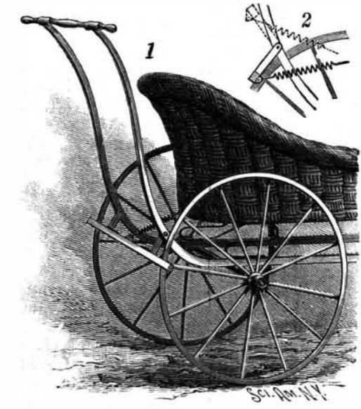
BOËS' BRAKE FOR CHILDREN'S CARRIAGES.

This is a simple form of brake, applicable to any style of carriage that is pushed along by means of the handle bar at the rear. The improvement has been patented by Mr. Frederick O. Boës, of No. 1591 First Avenue, New York City. It consists of a bar adapted for engagement with the tires of the rear wheels, the bar being roughened or covered with leather or other suitable material at the places of contact, and being attached to the handle bars by short pivoted links. This pivotal connection is such that when the brake bar is in its lower position it rests