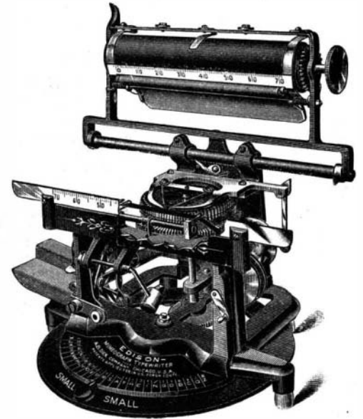
With carriage raised and scale cut away, showing ribbon movement.