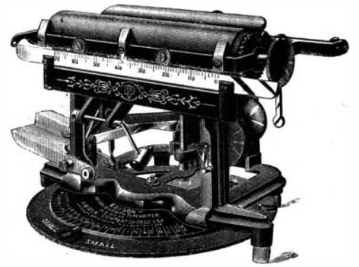
Machine in position for writing.

No. 1 having the same letters, figures and characters common in the standard machines, No. 2 having the same type as No. 1, with an additional number and a wider carriage for the admission of paper, and No. 3