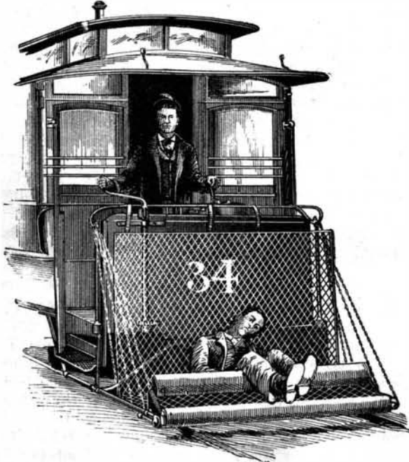
THE ROBINS LIFE GUARD FOR STREET CARS.

The many run over accidents which have happened since the general introduction of electric and cable cars, to take the place of horse cars, have caused not a few inventors to turn their attention to the devising of some practical means of prevention, in the way of efficient and not too expensive or cumbersome life guards or safety fenders, but as yet nothing has been brought forward which has met with sufficient favor to be generally adopted. Our illustration represents one of these devices, of which a number of successful trials have been made during the past six months. The man picked up by the fender, as shown in the picture, was said to have been struck by the guard when the car was running at the rate of twelve miles an hour, this trial having been made in Brooklyn in October last. This fender has across its front an open-end rubber tube, five inches in diameter, supported at a height