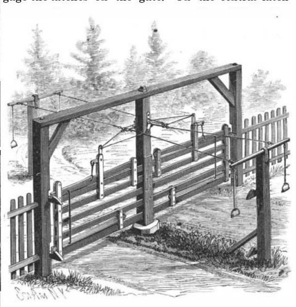
MULCAHY'S FARM GATE