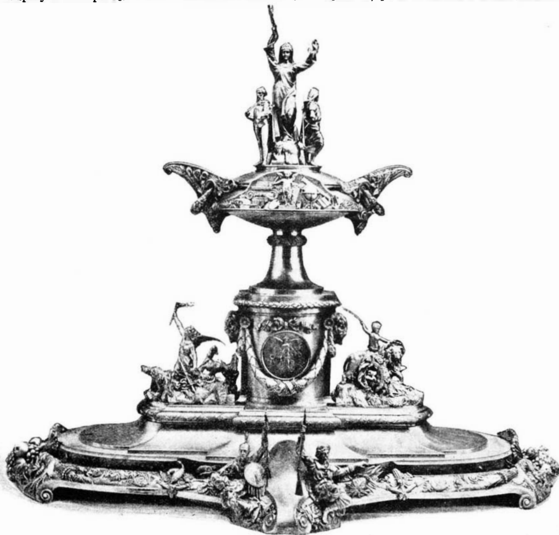
THE WORLD'S COLUMBIAN EXPOSITION—THE CENTURY VASE.

This most elaborate and highly finished representation of American art work in silver, valued at $25,000, and designed to commemorate the completion of the first century of the republic, forms a portion of the exhibit of the Gorham Manufacturing Company at the Columbian Exposition. Their display is in a pavilion at the beginning of the United States section, in the Manufactures and Fine Arts building, its main entrance being on the circle bounded by the four countries, the United States, Germany, England, and France. The vase is 4 feet 2 inches high, and its base is 5 feet 4 inches long, the weight of silver in it being 2,000 ounces. The pioneer and Indian on the front of the oval base suggest the first phase of life here, and at the extremities of the oval are festoons of native flowers. Above, on the left, is represented the genius of war, and on the right a lion led by children. The front panel of the vase, rising from the plinth, represents Genius ready to inscribe on the tablet the progress made in literature, science, etc., while surmounting the vase are four figures, the three subordinate ones representing Europe, Asia, and Africa, while the central and highest shows America inviting all nations to unite with her in an international exposition.