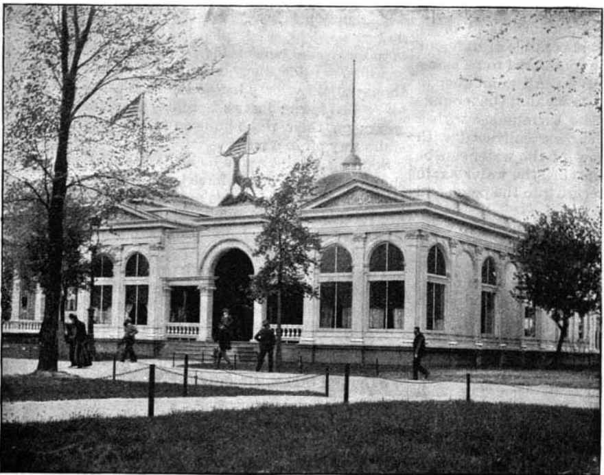
THE MONTANA STATE BUILDING.