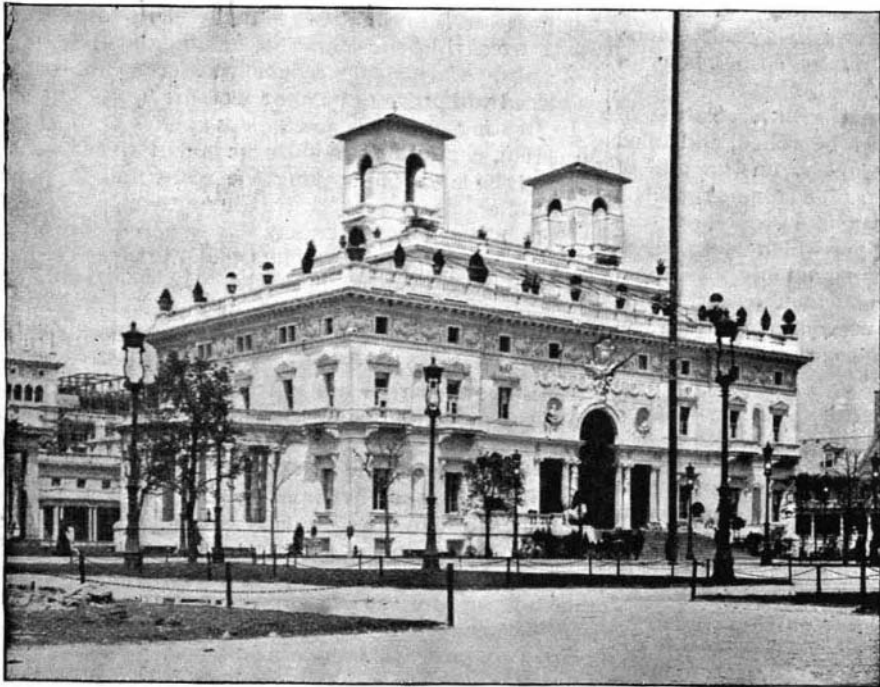
THE NEW YORK STATE BUILDING.

It will be interesting to those who have anything to do with sheet iron boiler plate or similar material to have an easily remembered rule for finding the weight per square foot of material they are working with. It has been found by experience that a square foot of iron plate \frac{1}{8} inch thick weighed almost exactly five pounds, and this forms a basis for a very simple and easy rule. As a square foot of iron \frac{1}{8} inch thick weighs five pounds, a square foot of \frac{1}{4} inch iron will weigh ten pounds, and we can say that the area of any sheet iron (or plate iron) in square feet multiplied by the thickness in one-eighths and multiplied by five will give the weight of the piece. There is a piece of tank iron 5-16 inch thick, 3 feet wide, and 5 feet long, how much does it weigh? The area will be 3 feet × 5 feet, or 15 square feet. Now how many eighths is 5-16 of an inch? Since \frac{1}{8} = 2-16 and 2 is contained in 5 2\frac{1}{2} times, we say 5-16 = 2\frac{1}{2} eighths, or 2\frac{1}{2} times 5 pounds = 12\frac{1}{2} pounds per square foot, and as there are 15 square feet we have