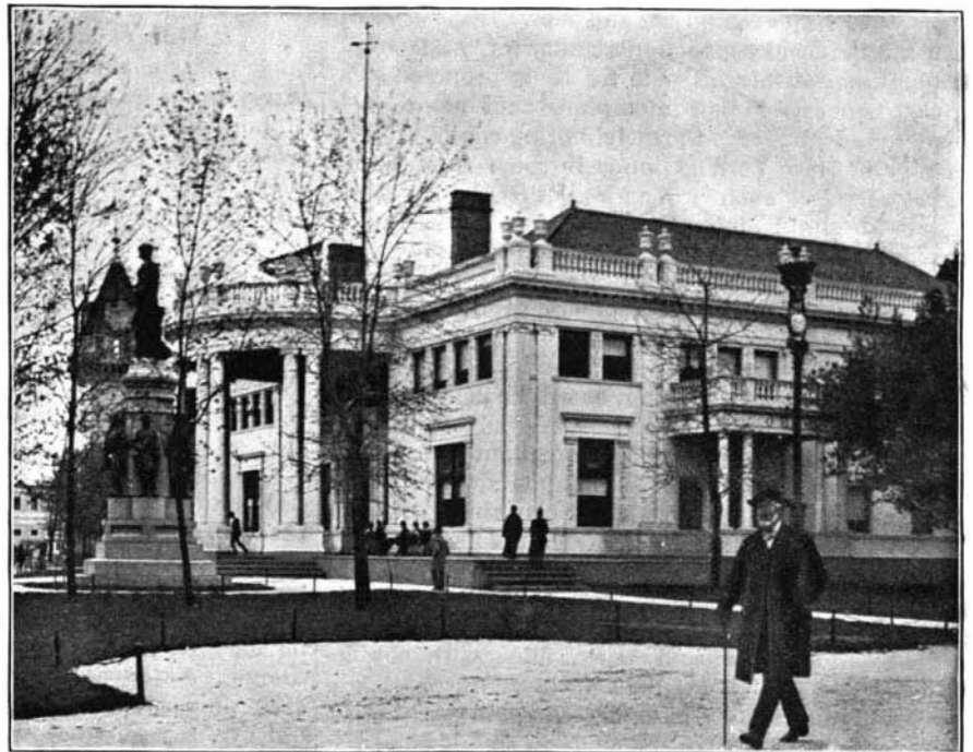
THE OHIO STATE BUILDING.