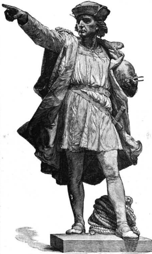
BARTHOLDI'S SILVER STATUE OF COLUMBUS.

As a work of art, this statue has been pronounced by