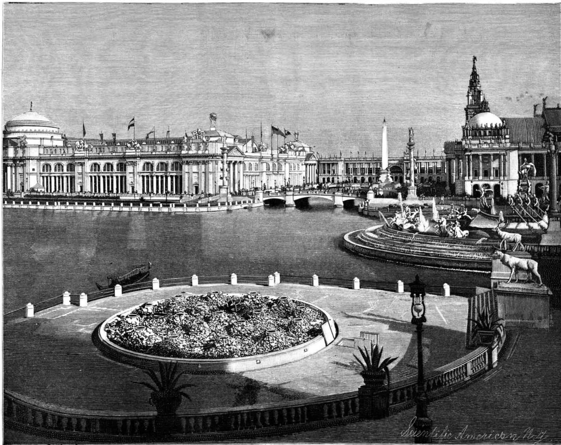
THE LUMINOUS FOUNTAIN.