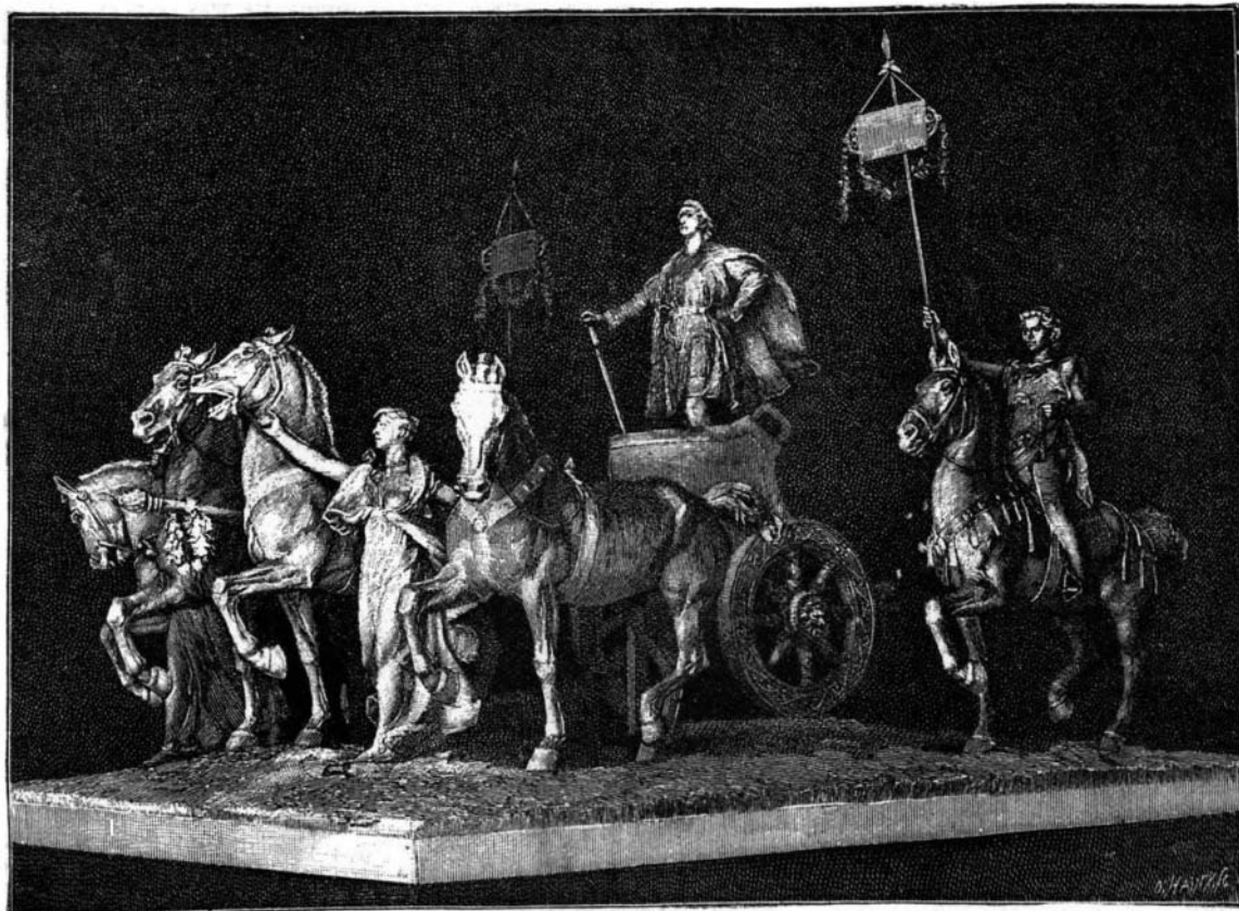
SCULPTURE AT THE WORLD'S FAIR—STATUE OF COLUMBUS ON THE PERISTYLE.

Mr. Jacksh, of Trieste, Moravia, as quoted by the Popular Science Monthly , names four sulphurets which become phosphorescent after a brief exposure to daylight—the sulphurets of calcium, strontium, barium and zinc. The last compound has been obtained in a luminous condition only recently by distillation in a vacuum. Prepared in the usual way, by precipitating soluble salts of zinc with sulphurets, it shows no signs of phosphorescence. Sulphuret of barium gives a yellowish orange glow, but only for a few minutes after each exposure to the light, and is of as little use as the sulphurets of stron-