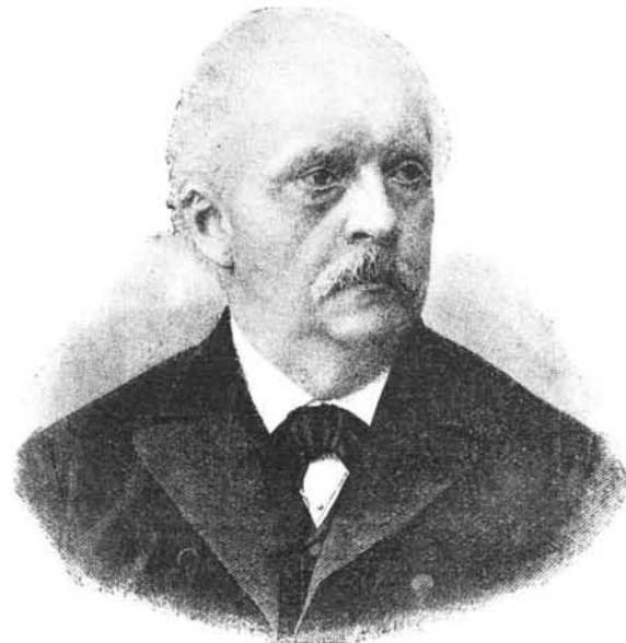
HERMANN VON HELMHOLTZ.