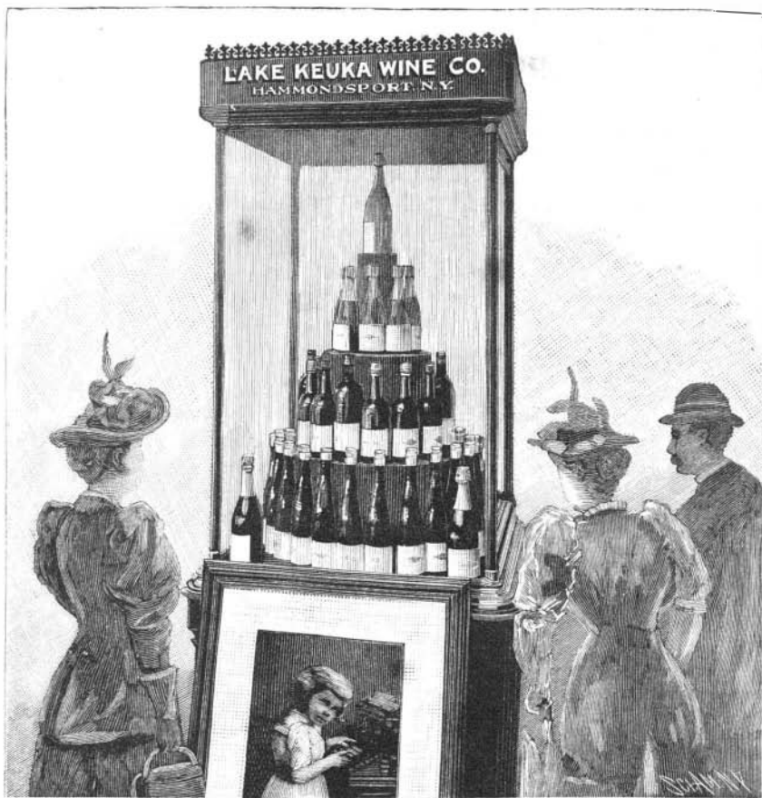
EXHIBIT OF THE LAKE KEUKA WINE CO.

The Bosworth feedwater regulator is an apparatus for maintaining an even water line in a steam boiler. This it does with greater precision and certainty than is possible for any fireman or attendant to do. The valves are controlled automatically by