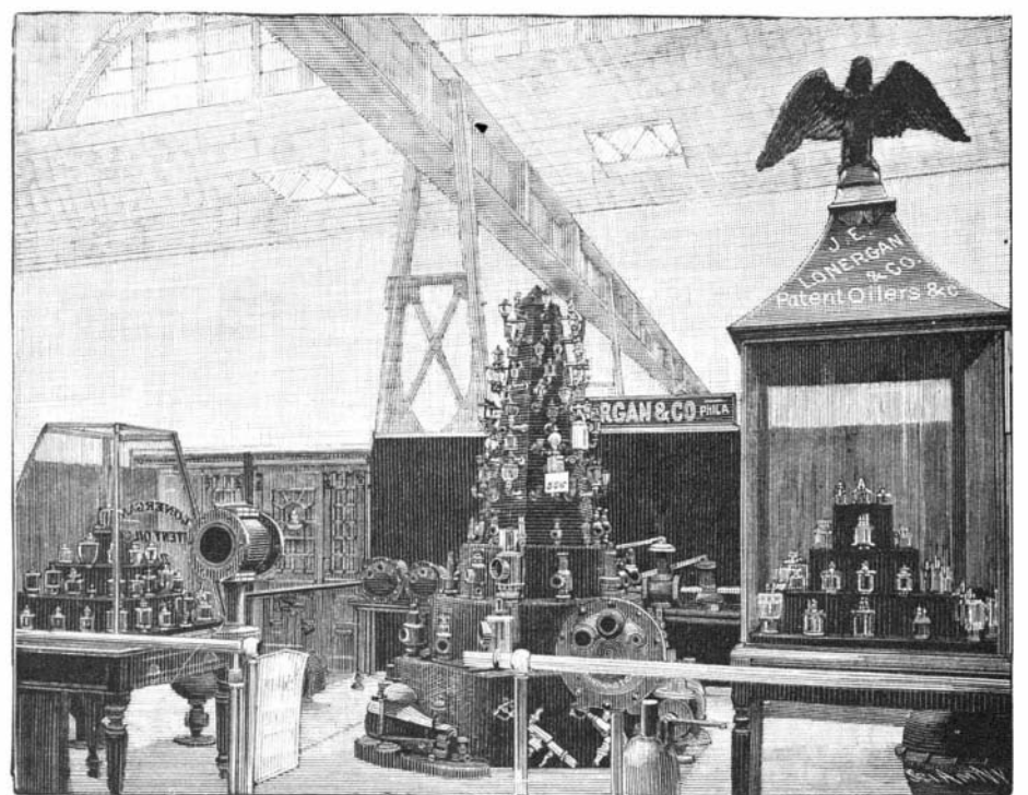
SAFETY STEAM APPLIANCES, ETC.—J. E. LONERGAN & CO., OF PHILADELPHIA.

THE WORLD'S COLUMBIAN EXHIBITION—ENGINEERING SPECIALTIES—THE LAKE KEUKA WINE CO.