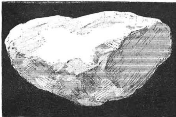
"The Largest Diamond in the World." The "Jagersfontein Excelsior," recently discovered in the Orange Free State. (Exact Size.)

"You may have noticed by cable that the largest diamond the world has ever seen has been found here. This place is all excitement about it, and it may make