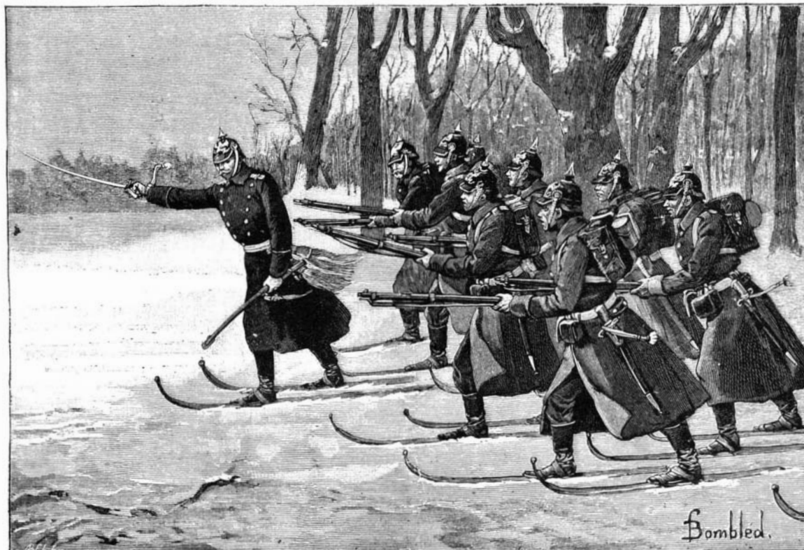
SNOW SHOE EXERCISE IN THE GERMAN ARMY.

Not wishing to remain in a state of inferiority in this regard, in face of his neighbors, the Emperor of Germany has had snow shoes tried in the Eighty-second regiment of infantry, stationed at Goslar, upon the confines of Hanover and Brunswick.