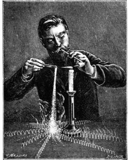
COMBUSTION OF TINFOIL IN THE FLAME OF A BLOWPIPE.

Doors for the use of passengers are provided in the sides of the car. Passengers sit comfortably, back to