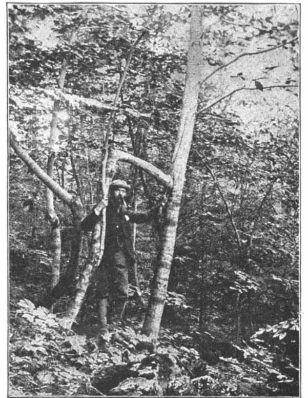
A CURIOUS TREE GROWTH.

The beautiful picture which appears in the issue of May 13 of the SCIENTIFIC AMERICAN, showing a remarkable tree growth at Saratoga, leads me to send