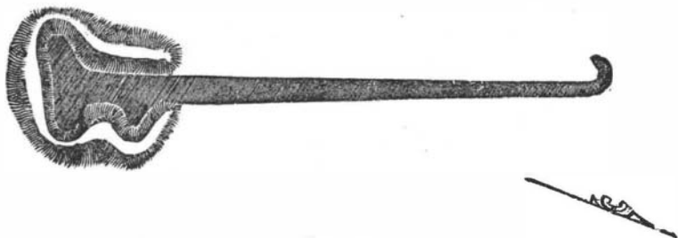
INTAGLIO EFFIGY NEAR FOREST HOME CEMETERY.

Besides the uncounted hundreds of mounds of earth,