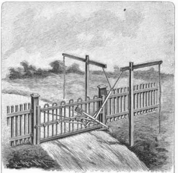
WILLIAMS' ROAD GATE.

ed lever is adjustably held in desired place by a set screw, and in operation either rope is pulled only sufficiently, in opening or closing the gate, to swing the lever past its vertical position, the weight of the lever then causing the completion of the inward and outward movement of the gate.