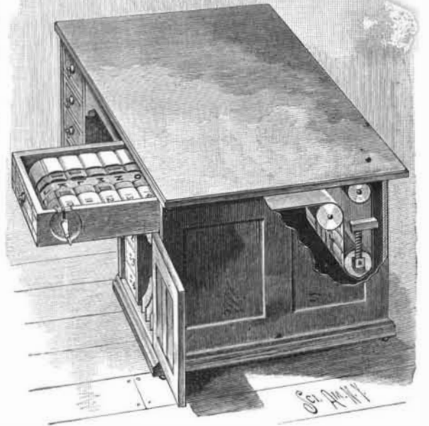
NEFF'S DESK ATTACHMENT.

that the back may be raised in case an inclined plane is preferred to write upon. A small drawer is sometimes located at the rear of the desk and under the lower roller to receive any papers that might accidentally be dislodged and fall from the pockets in the