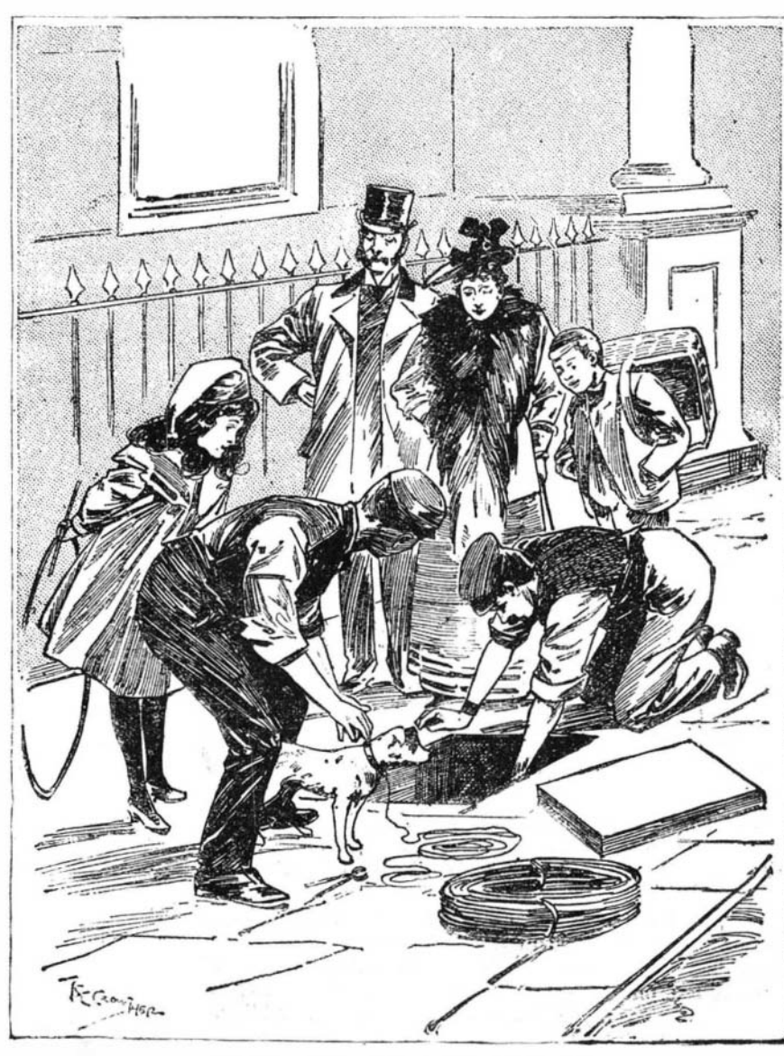
"STRIP" THE ELECTRICAL TERRIPR

The Tasmanians seemed to have kept up this rudimentary art in their remote corner of the world until the present century, and their state of civilization thus became a guide by which to judge of that of the prehistoric Drift and Cave men. whose life in England and France depended on similar though better implements. The Tasmanians, though perhaps in arts the rudest of savages, were at most only a stage below other savages, and did not disclose any depths of brutality. The usual moral and social rules prevailed among them, their language was efficient and even copious, they had a well marked religion in which the spirits of ancestors were looked to for help in trouble, and the echo was called the "talking shadow."