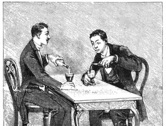
FIG. 4.—WATER CHANGED INTO WINE AND WINE INTO WATER.

An organist says that a cow moos in a perfect fifth octave, or tenth; a dog barks in fifth or fourth; a donkey brays in a perfect octave; and a horse neighs in a descent on the chromatic scale.