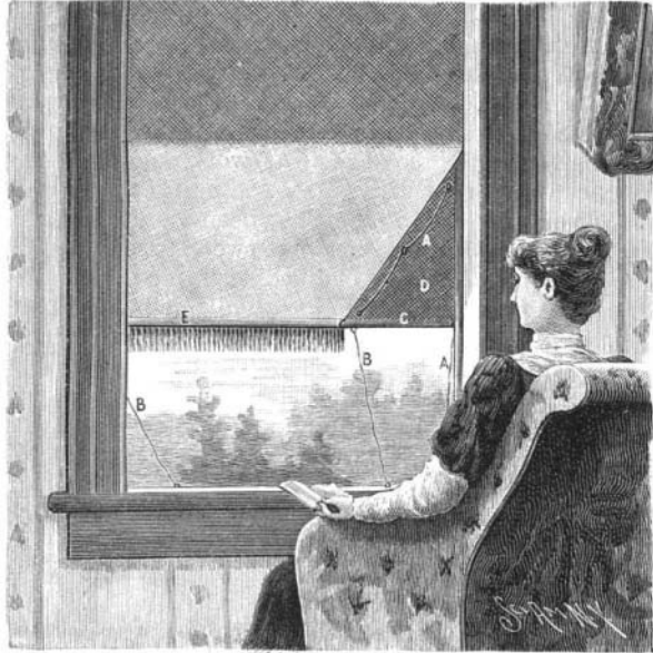
BRANNER'S WINDOW SHADE AWNING.