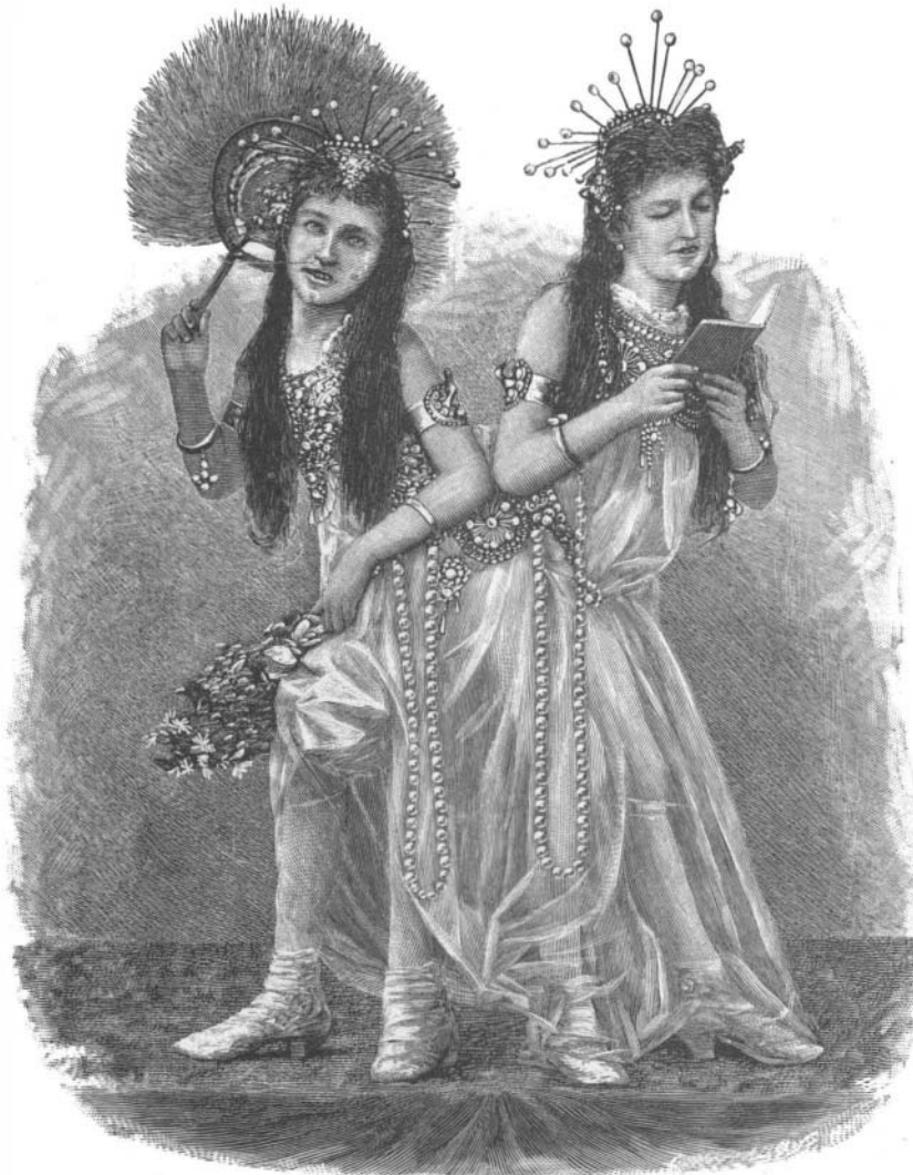
THE BOHEMIAN TWINS.