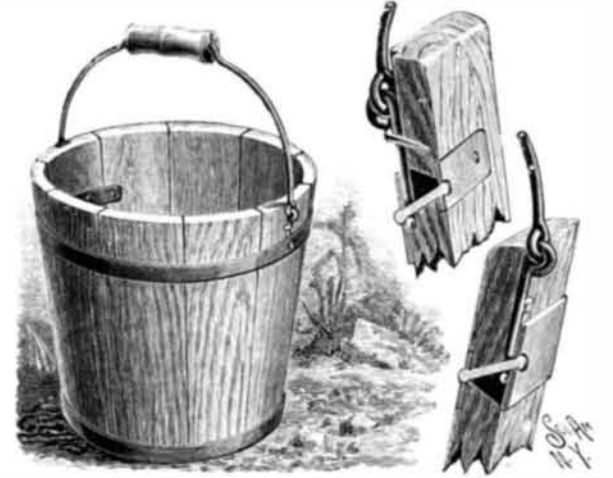
REESE'S IMPROVED BUCKET.