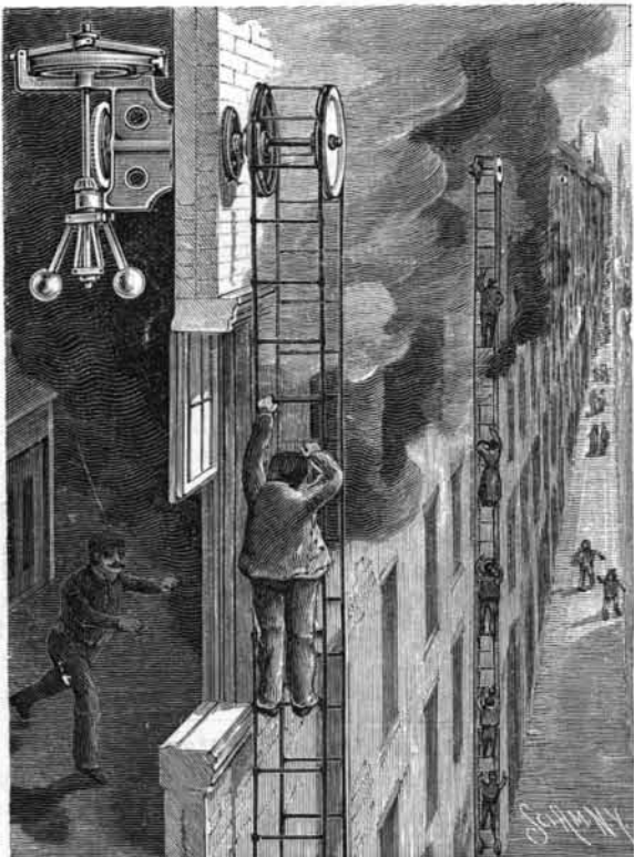
MCCOLLUM'S FIRE ESCAPE.

The fire escape shown in the illustration is operated automatically by the weight of the persons escaping from a building to which it is attached, the improvement being designed to supersede the employment of cumbersome and dangerous iron ladders, ropes, cables, etc. The invention forms the subject of a patent recently issued to Mr. William J. McCollum, of No. 182 Van Houten Street, Paterson, N. J. At a suitable point near the windows in the outside wall of the building, near the ceiling of the upper story, is secured a tube, whose inner end is integral with a cast iron bracket