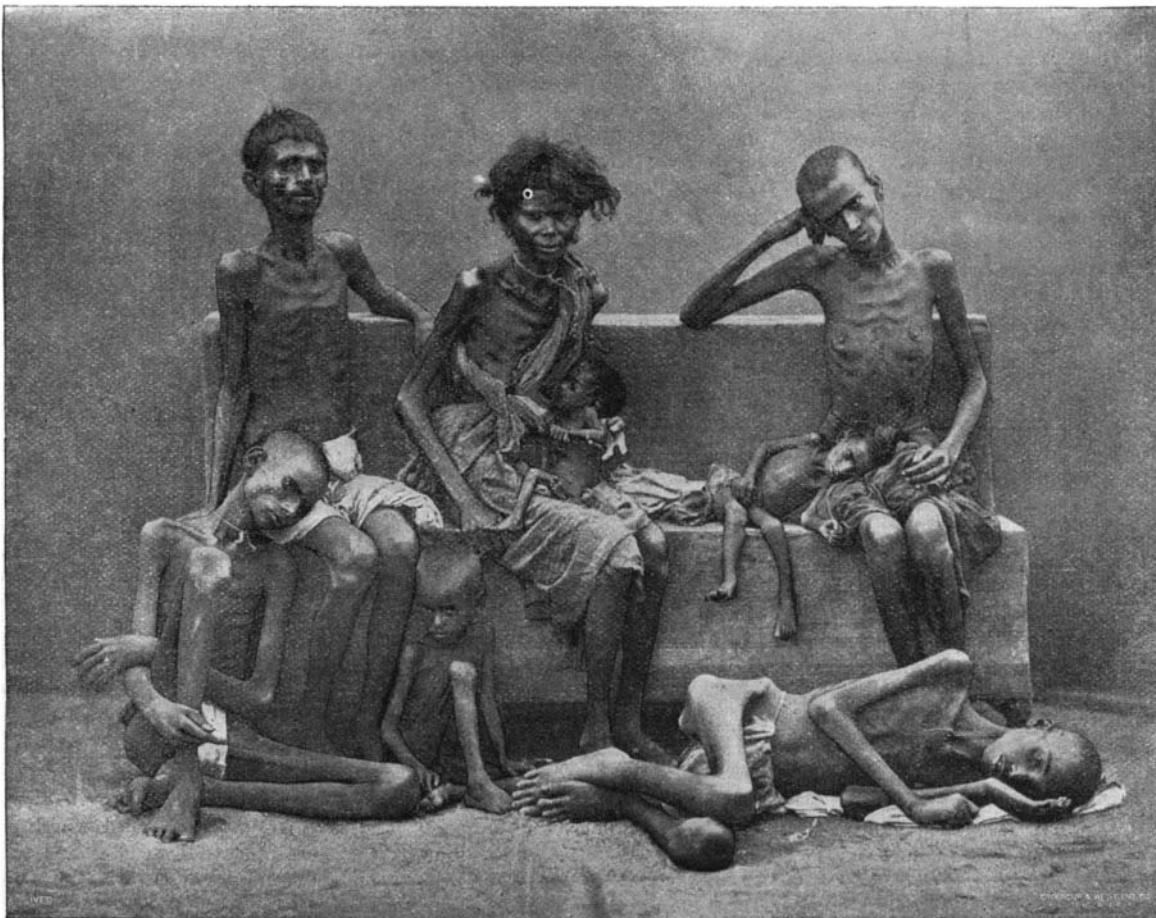
THE FAMINE IN INDIA—REFUGEES IN A GOVERNMENT CAMP.

With all that the English government are doing to alleviate the horrors of the famine, there is much unnecessary suffering, which arises from the peculiarities of the people, particularly the higher castes. For a caste man to eat or drink anything which has been touched by one not of his caste is so degrading that he would rather suffer death. This is a religious matter with him, and there