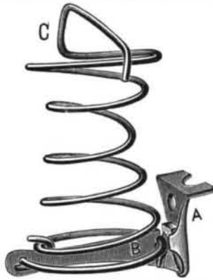
GILLETTE'S BED SPRING.

The simple and inexpensive device shown in the illustration is adapted for attachment to any ordinary bedstead rail to support the slats and form a cheap, simple and easy spring bed. It has been patented by Mr. Wilbur L. Gillette, of Yalesville, Conn. The base or support of the spring consists of a bracket, A, the wall plate of which rests against and is secured to the inner side of the rail, or the bracket may be secured in the notches where the slats are usually inserted. The main bracket arm, B, has a hole at its outer end and a notch at its inner end in which the bed spring wire is secured, the upper free