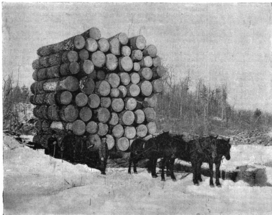
LOGGING IN MINNESOTA.

The high pressure cylinders are 40 inches in diameter, the intermediate pressure cylinders are 59 inches in diameter, and the low pressure cylinders are 88 inches in diameter, and each is adapted for a stroke of 4 feet 3 inches. The cylinders are all independent of each other, and are steam jacketed. The high pressure cylinders are each fitted with a liner of forged steel,