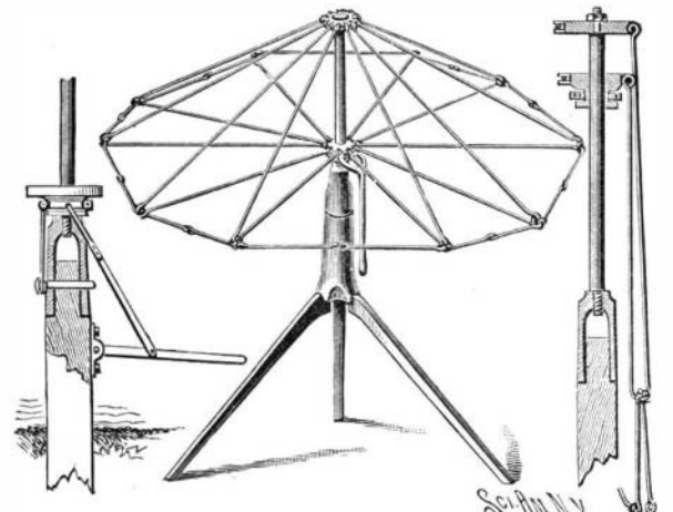
McCANDLESS' CLOTHES DRIER.

The improved device shown in the illustration is adapted for use indoors and out, and can be compactly stored in a small space when not in use, and quickly expanded for service. It has been patented by Mr. James W. McCandless, of Canon City, Col. A tubular standard or rod has at its upper end a revoluble cap-plate in which are pivoted a number of galvanized spring wire rods. Sliding loosely on the standard below the cap is a runner in which other spring wire rods are pivoted, each of the lower wires being connected with one of the upper wires through interlocking eyes, while the outer ends of the connected wires are united by a series of double links. The runner has an annular groove, in which is loosely mounted a collar from which depends a handle. When the drier is to be used indoors the standard is preferably mounted on a tripod, but when used out of doors it may be attached to a