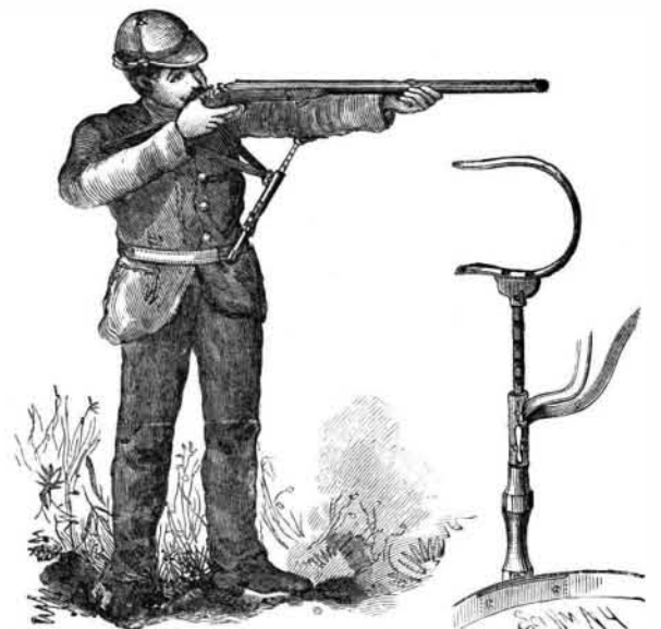
SPROUL'S ARM REST FOR GUNNERS.

The device may be extended by simply pulling the arm loop upward, but to reduce its length the spring key which engages the ratchet bar must be pressed before the bar can be moved downward. At the upper and lower ends of the ratchet bar there are square notches for receiving the spring key. When