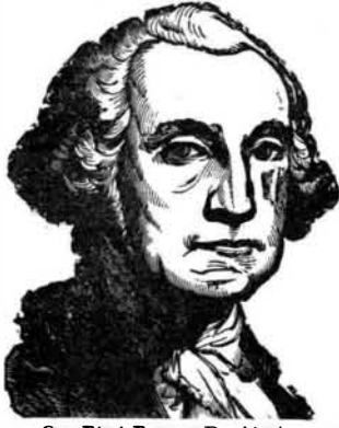
Our First Farmer President. We may have another one.

The Rural Publishing Co., Times Building, New York.