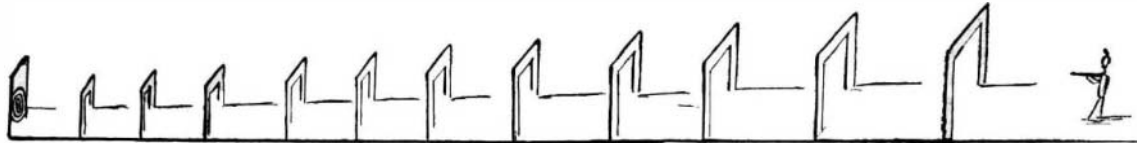
A NOVEL FORM OF GUARDS FOR RIFLE RANGES.

Rifle practice is a source of much pleasure and healthful recreation, also creating a spirit of rivalry and emulation among the various members of a corps