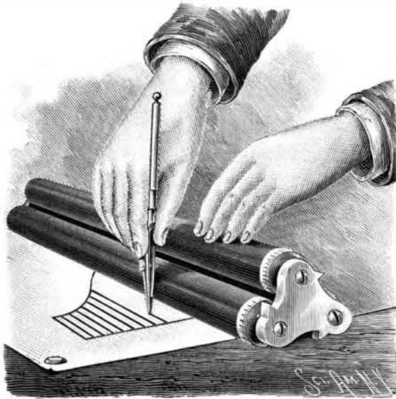
FORWOOD'S PARALLEL RULER.