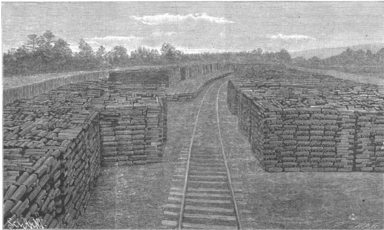
A PIG IRON STORAGE YARD, BESSEMER, ALA.

base is 18 feet 3 inches. The cylinders are 22 inches in diameter and have a stroke of 28 inches. The boiler is of steel, \frac{5}{8} of an inch thick, and is 6 feet 2 inches in diameter. There are 280 flues, 2\frac{1}{4} inches in diameter and 18 feet 6 inches long. The firebox is 11 feet long and 3\frac{1}{2} feet wide. The cab is placed on top of the boiler and midway between the ends. There are two sand boxes, one on the front of the boiler and one on the back, so that sand can be placed on the rails whether the locomotive is running forward or backward. There is a powerful air brake which operates on each driving wheel. There are headlights and steps at both ends, like those of a