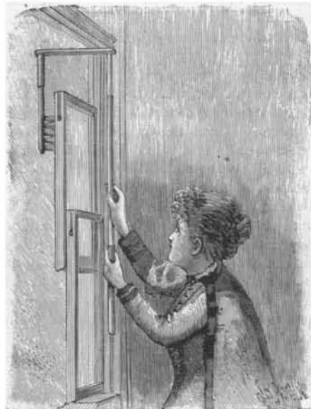
MARTINOT'S WINDOW CLEANING BRUSH.

A brush with which the upper as well as the lower sashes of windows may be readily cleaned, and with which the outer faces of the panes may be as easily cleaned as the inner faces, is shown in the accompanying illustration, and has been patented by Mrs. Mary L. W. Martinot. The handle of the brush is made in