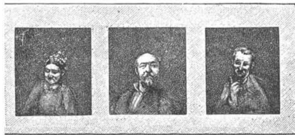
Fig. 3.—FACSIMILE OF PORTRAITS OBTAINED WITH THE APPARATUS.