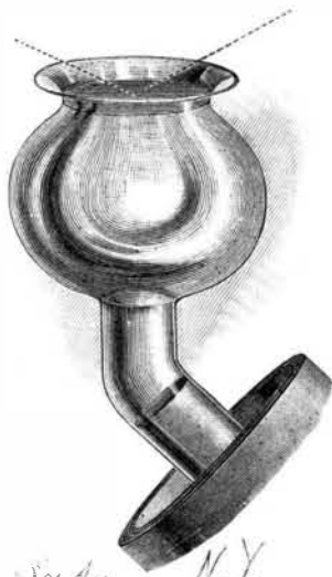
Fig. 1.—PROJECTION OF VIBRATING SOAP FILM.

A similar experiment is illustrated by Fig. 2. This is a modification of the opeidoscope. A thin membrane of goldbeater's skin or rubber is stretched over a wooden or metallic cell and secured by a winding of thread. To the center of the membrane is cemented a small thin mirror. The light is received and reflected, as in the other case. When the membrane is vibrated, intricate bright figures appear on the screen, the figures varying with the character of the vibration.