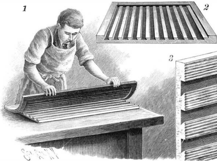
CURRAN'S GROOVED PLASTER SLAB.

According to the Paris correspondent of the Medical Press and Circular for September 17, 1890, Professor Poucel, surgeon to the Marseilles Hospital, suggested, in 1884, that, in order to explain the production of cancer, it would be found at no distant date that the microbe of cancer would be discovered by the micro-