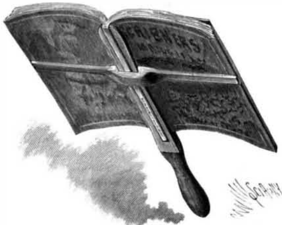
STRIPPEL'S MAGAZINE AND BOOK SUPPORT.

The illustration represents a light, inexpensive, and convenient portable device, which may readily be