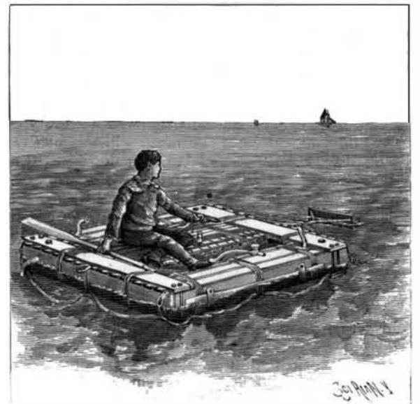
EDWARDS' LIFE RAFT.