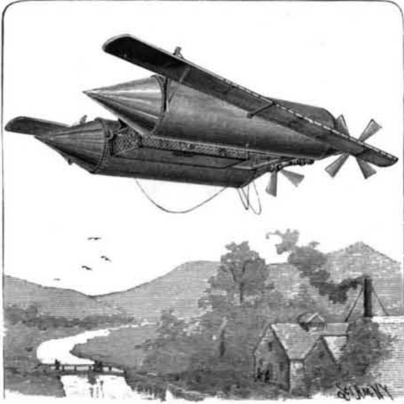
BECHTEL'S AIR SHIP.