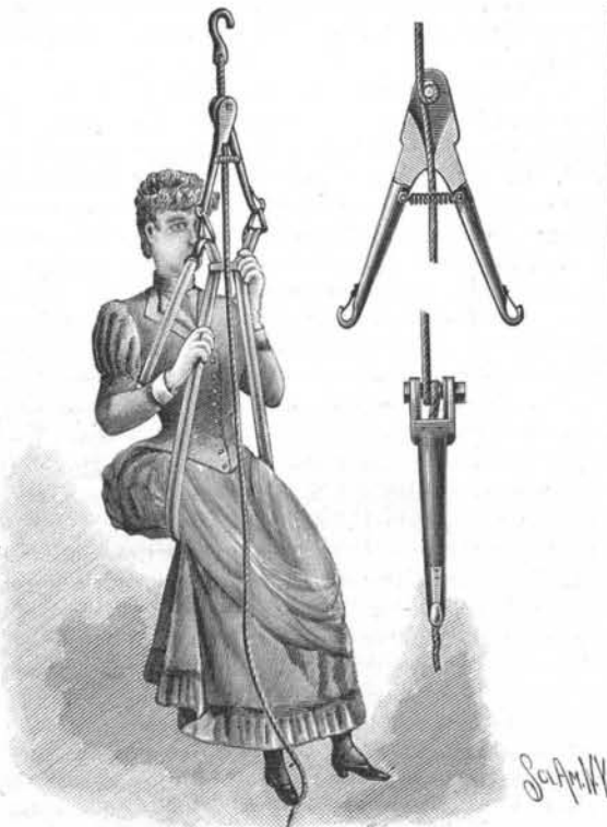
ABBOTT'S FIRE ESCAPE.