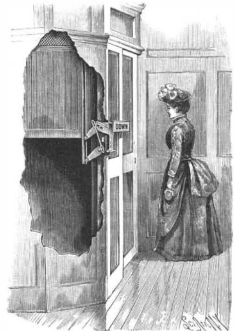
HAYWARD'S INDICATOR FOR PASSENGER ELEVATORS.