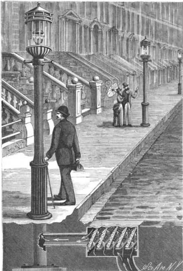
WORTHINGTON'S SEWER VENTILATOR.

The illustration herewith represents a construction combining a tubular lamp post, pillar, or standard with a disinfecting chamber, the latter having connection with a sewer pipe, whereby the gases will be thoroughly disinfected and carried off, or passed through a lamp or gas flame and consumed. This invention has been patented by Mr. Thomas P. Worthington, of Southshore, Blackpool, Lancaster County, England. Beneath the level of the pavement is placed a box with detachable lid, the box being connected by a pipe from