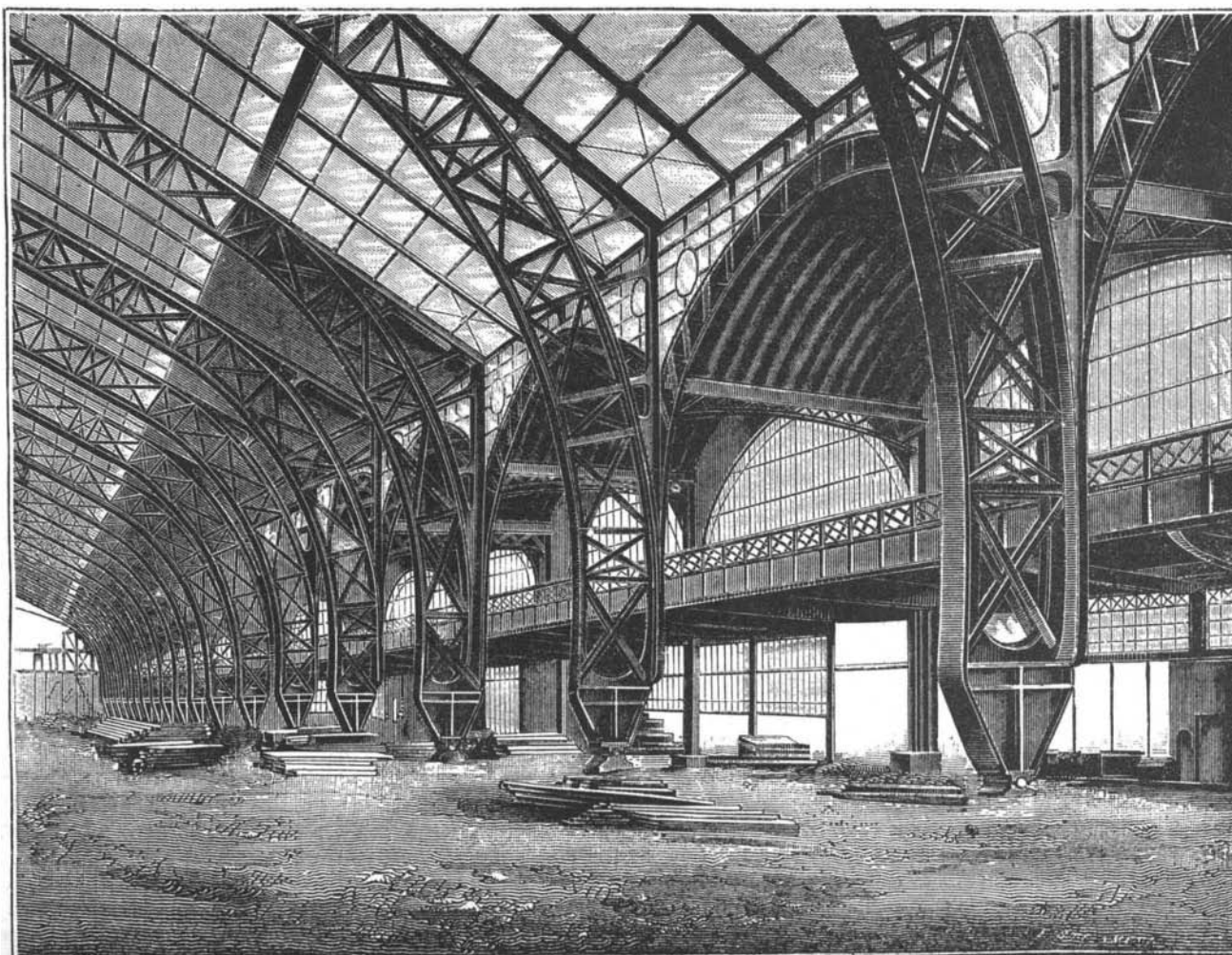
THE MACHINE GALLERY, PARIS EXHIBITION.

Our illustration gives some idea of the most important building on the Champ de Mars—the great machinery hall—which occupies nearly the whole width of the inclosure, and is parallel to the Ecole Militaire. It is 374 feet span and 1,378 feet long, and the roof is carried by 20 arched ribs jointed at the center and the