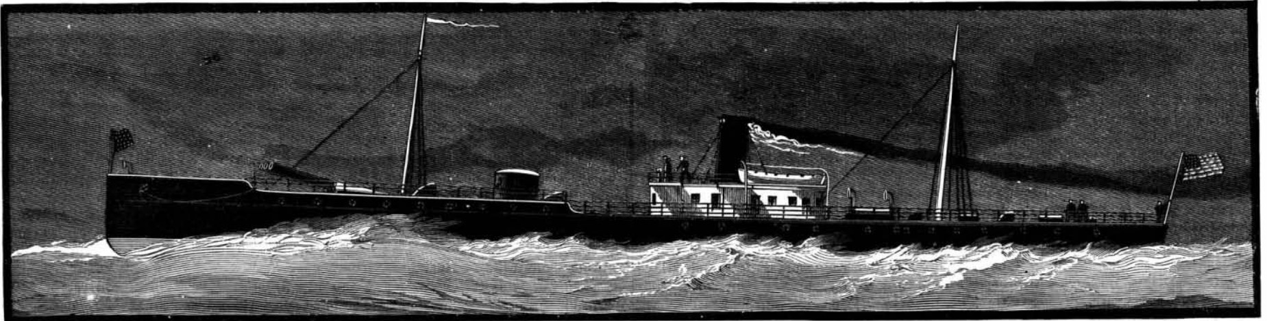
THE DYNAMITE CRUISER VESUVIUS.