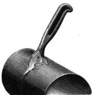
KING'S CAN OPENER.