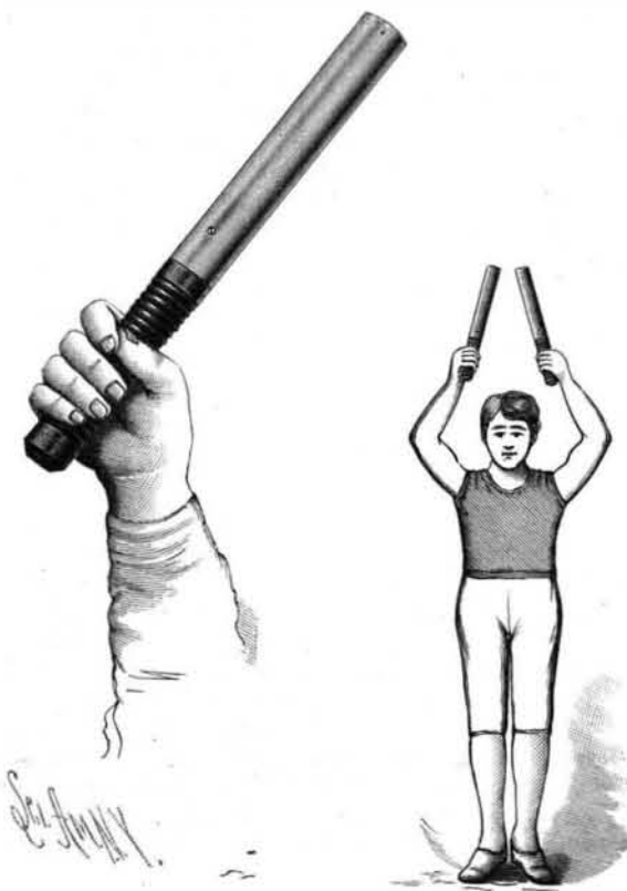
THE JESSUP EXERCISING CLUB.