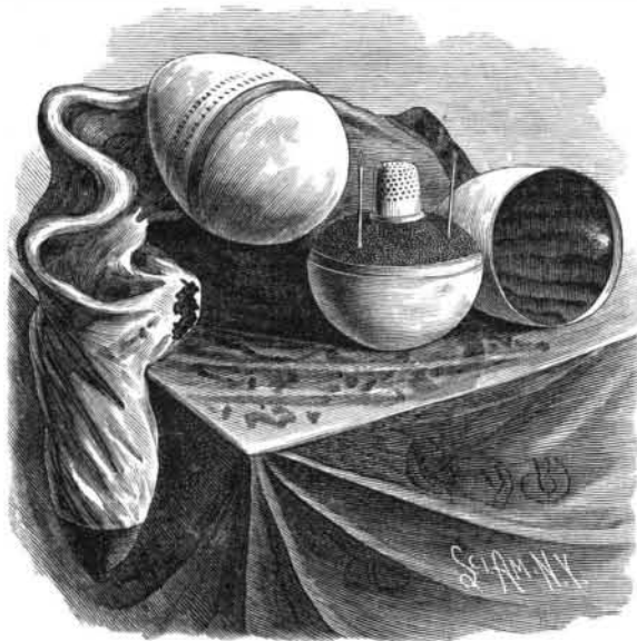
AUSTIN'S DARNING LAST.