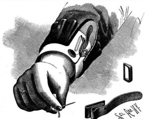
PERRY'S CUFF HOLDER.

A cheap and practical cuff holder, designed more particularly for ladies' use, while also suitable for use on