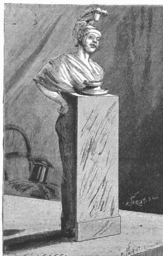
Fig. 2.—HOW THE BUST IS OBTAINED.

cardboard is placed upon the model's head, his hair and face are whitened with rice powder, and those portions of the body that it is desired to render visible are surrounded with white flannel. The background should be formed of black velvet. It in nowise interferes with the operation if the arms be raised. After the negative is developed, the figure that it is desired to preserve is cut around with a penknife, and the arms and all the portions that are not wanted are scratched out. The glass thus becomes transparent where the scratching has been done, and in the positive the bust stands out from a black background.— La Nature.