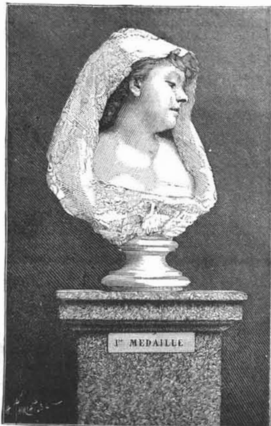
Fig. 1.—A PHOTO BUST.

Fig. 1 is the exact reproduction of a photograph. It gives a genuine portrait under the form of a marble bust. How such a result may be easily obtained is shown in Fig. 2. The model is placed behind a hollow column or thin pedestal of painted wood. If it be desired to represent a Roman emperor, a helmet of white