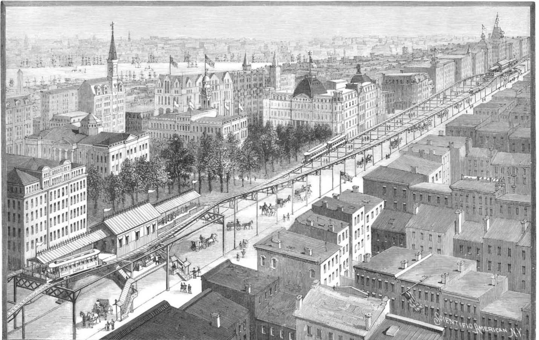
THOMPSON'S GRAVITY SYSTEM FOR RAPID TRANSIT IN TOWNS AND CITIES.—[See page 149.]