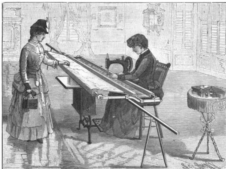
DAVIS' "1888" QUILTER.

lon, Long Island, N. Y. It is made with a fork-like frame, consisting of a rigid metal bar, as shown in Fig. 2, the two prongs passing up outside the horse's jaws, and their ends being turned over to make eyes, the prongs being united by a transverse mouthpiece, the center of which has an upwardly projecting inverted U-shaped portion. Above the center of the metal bar are loops for attaching checks from the girths of the saddle or the traces of the harness, and integral with the outer side of the prongs, opposite the mouthpiece, are similar loops for cheek straps to hold the auxiliary bit loosely in the middle of the mouth. A pad or protecting strap is held in engagement with the inner flattened end of the metal bar, which has slots for retaining the strap by which the device is secured to a harness.