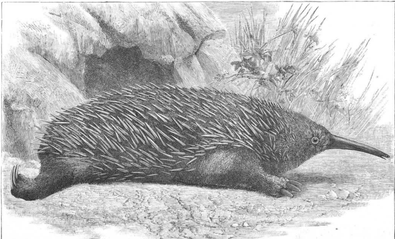
BRUIJN'S ECHIDNA (PROECHIDNA BRUIJINI), NEW GUINEA ANT EATER.

In consequence of the peculiarity of the animal captured at Nantucket, news of the fact was sent to the summer headquarters of the United States Fish Commission, at Wood's Holl, Mass., and the "whale," as the fishermen described it, was taken there, whence it will be sent, as a skeleton, to the National Museum at Washington, to form a part of the osteological collection there. The animal is a grampus ( Grampus griseus ), a species which is somewhat common throughout the North Atlantic. Several specimens have been taken, their capture being chiefly due to the habit of the species of skirting very near the shore, in pursuit of its food of small fishes and minute surface