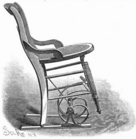
SMITH'S ROCKER FOR CHAIRS.