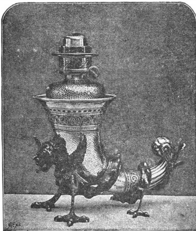
LAMP IN SILVER AND BRONZE—ADAPTATION OF ORIENTAL DESIGN.

The excellence of much of the work now executed by the leading American silversmiths is such that their productions unquestionably compare favorably with the best samples of foreign workmanship, while in all lines of plated goods our decided superiority over the manufactures of other countries will be readily ad-