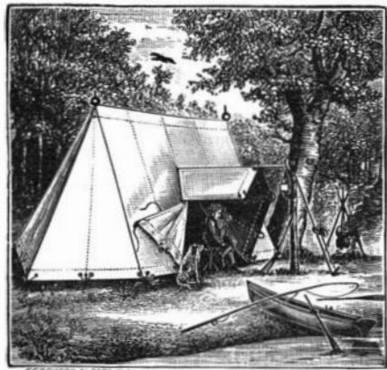
THE CAMPER'S FAVORITE TENT.